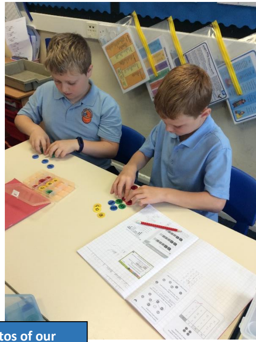
Here are some photos of our fabulous practical Mathematics work from the last half term!